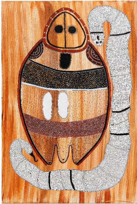
Rona Gungnunda Charles, Barramundi Dreaming , acrylic on canvas, 120 x 80 cm, 2023. With the permission of Wilinggin Aboriginal Corporation