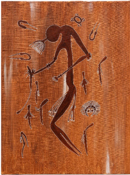
Leah Umbagai, Malan Jiunya Bushwoman, Mooloomooloony , acrylic on canvas, 80 x 60 cm, 2023.

With the permission of Dambimangari Aboriginal Corporation.