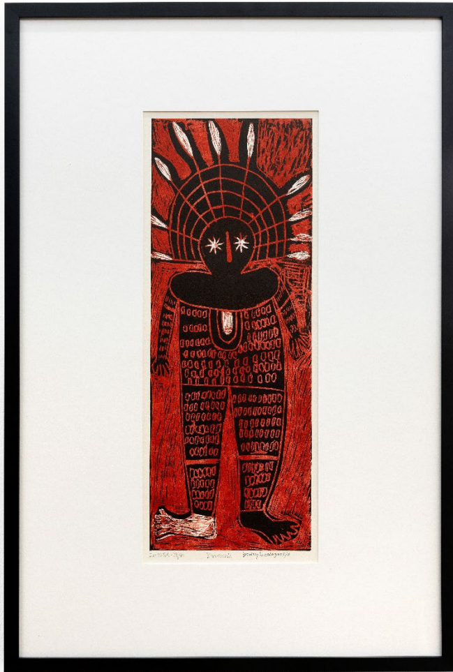
Donny Yornadaiyn Woolagoodja, Namarali ( Wororra god ), Coloured woodprint with ochre on paper, 60 x 25 cm , 2021.