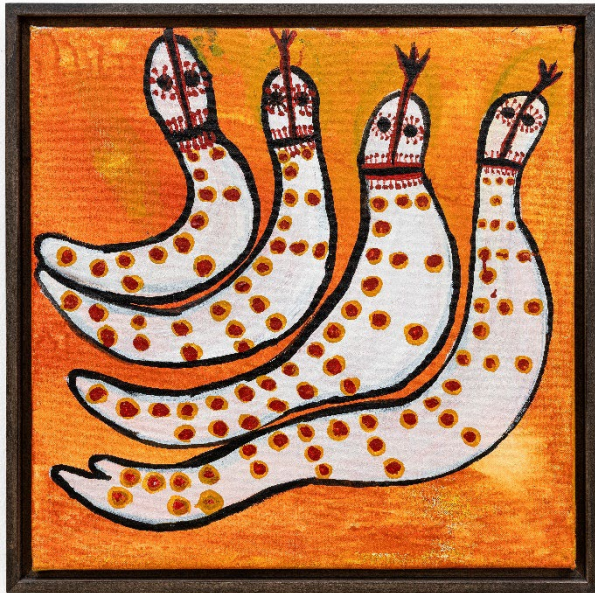
Yornadaiyn Woolagoodja, Ungud (snake) , acrylic on canvas, 45 x 45 cm, 2024.

Contemporary art purchased from the Mowanjum Aboriginal Art Centre, Derby, and the Japingka Gallery in 2024