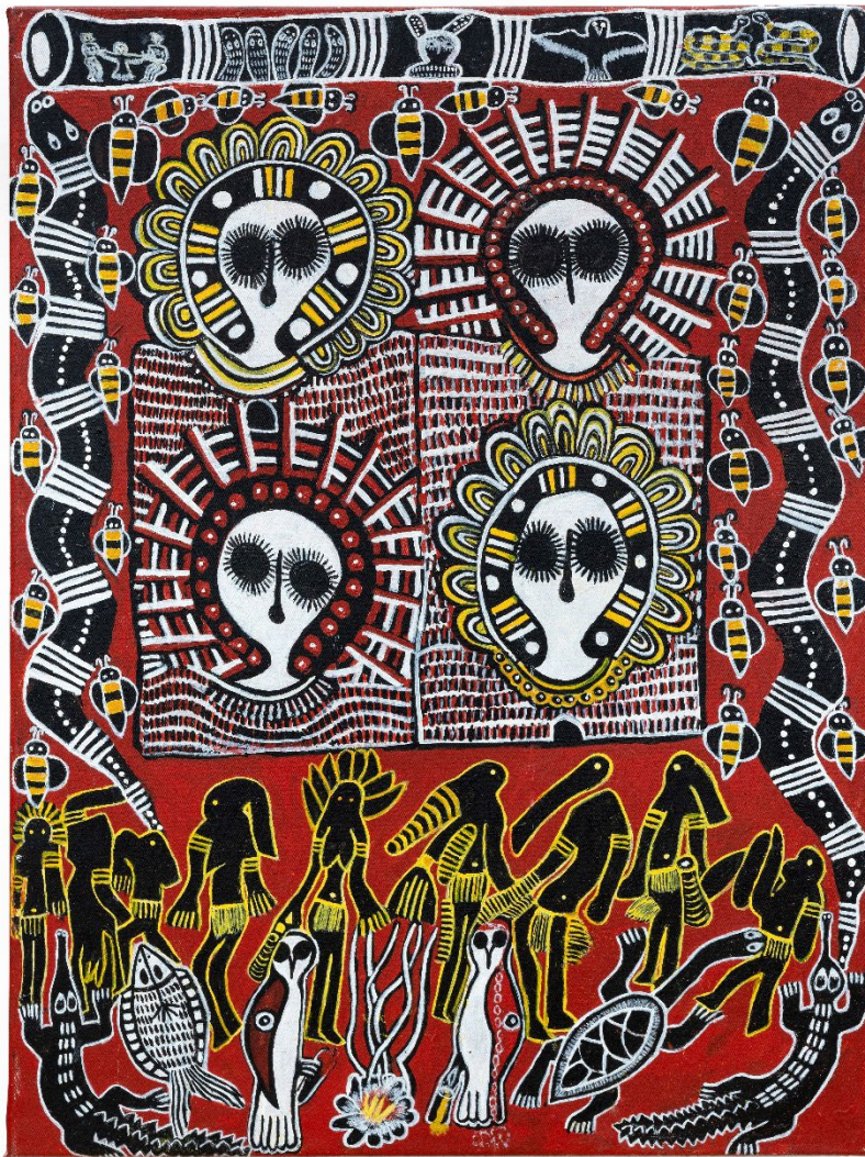
Mildred Minggi Mungulu, Wandjina Dreaming , Acrylic on canvas, 120 x 91 cm, 2023.