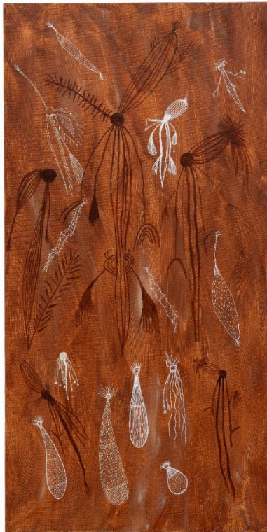
Leah Umbagai, Geeyorn Geeyorn, Maagorddeegorddee , acrylic on canvas, 120 x 60 cm, 2023.

Photo: Wolfgang Günzel. With the permission of Dambimangari Aboriginal Corporation.